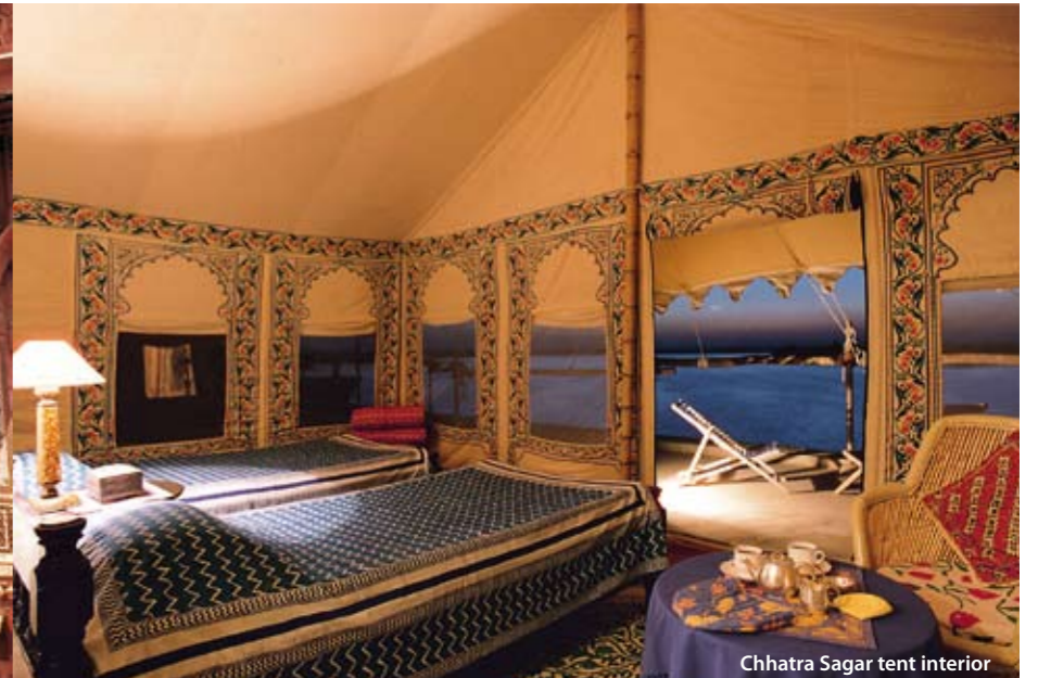
Chhatra Sagar tent interior