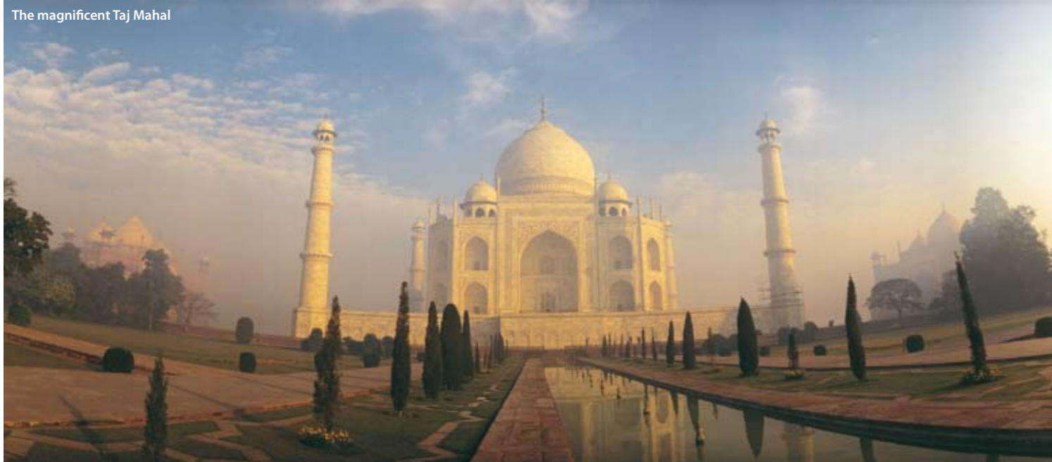
The magnificent Taj Mahal

One unique experience, which really hit the high notes, was having drinks with Maharajah of Jaipur. It was great, a real window into the world of the Maharajahs.