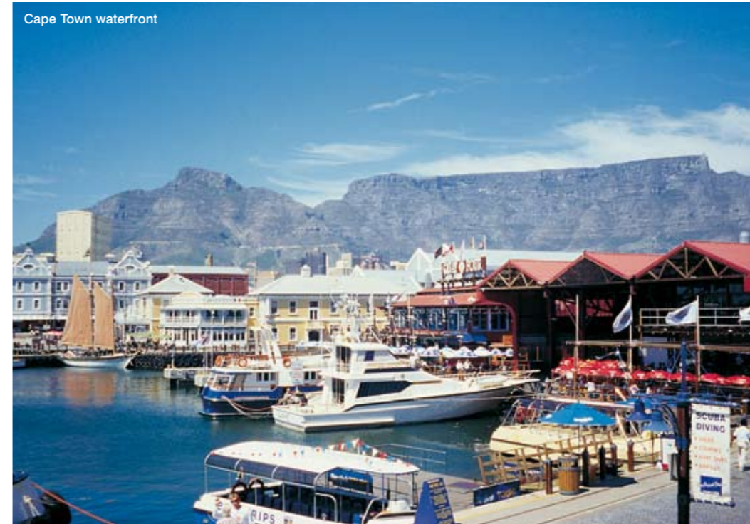
Cape Town waterfront

hours from Cape Town you'll find the coastal town of Hermanus with its sweeping beaches and flanked by a magnificent mountain range. It's been the holiday town of Capetonians for generations.