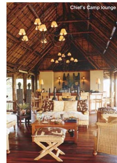
Chief's Camp lounge

Do your homework well when deciding on a your safari expedition as there are some exceptionally expensive options around. You certainly won't go wrong with an RCI property close to the Kruger National Park where your chances of seeing all the wildlife you've yearned to experience is richly fulfilled.