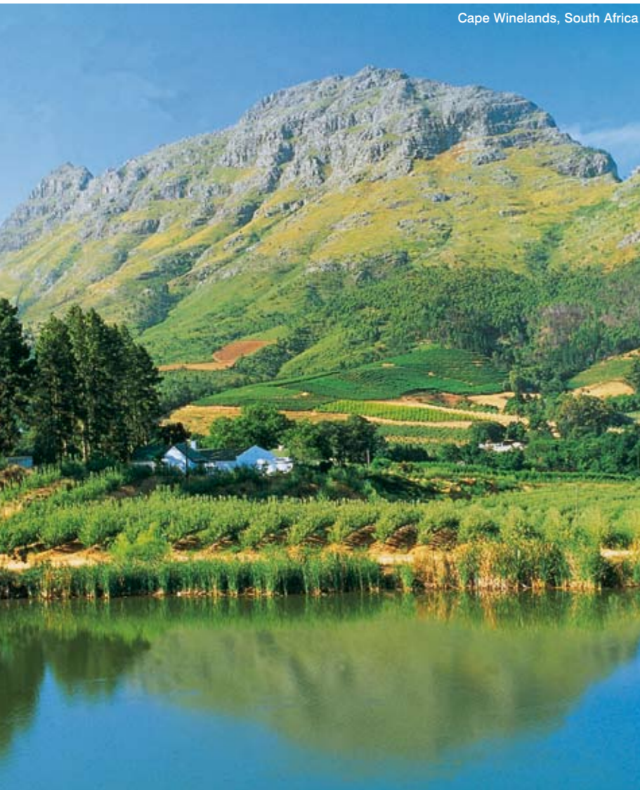
Cape Winelands, South Africa